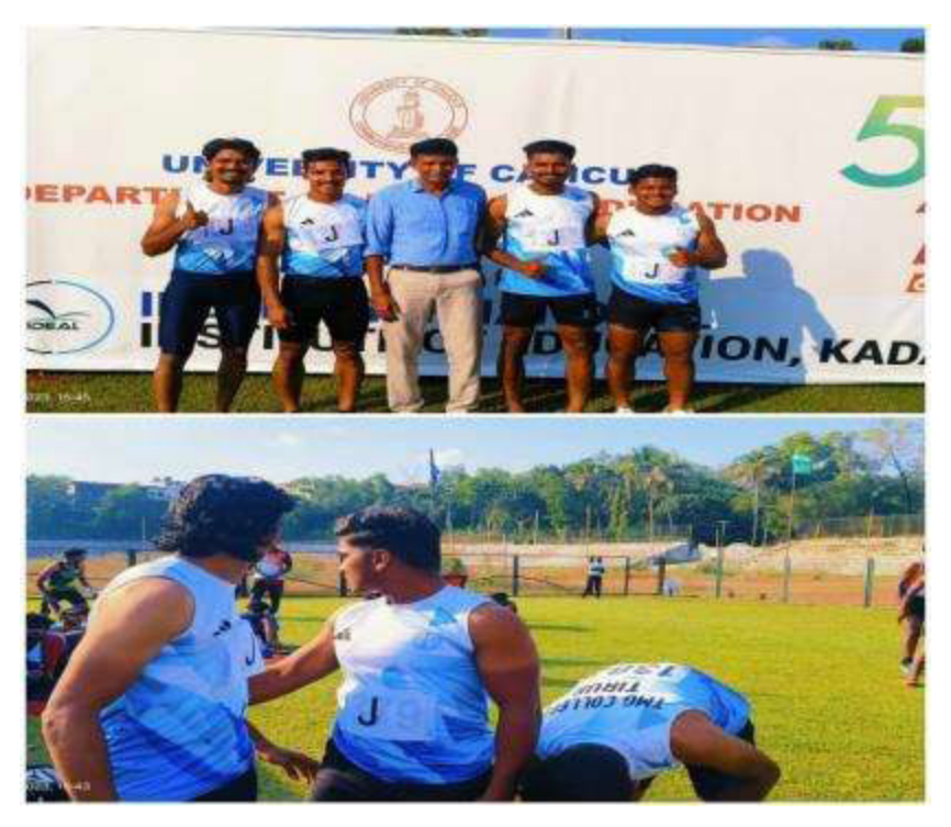
10. Senior State Soft-Base Ball Championship –Winners

TMG Athletes were participated in almost events of the Calicut University Athletics Meet held at University Synthetic Track on 6<sup>th</sup> to 8<sup>th</sup> December 2023.Most of the athletes were entered in the final round track event .Our college 4x100 M Relay team showcased marvelous performance in the final