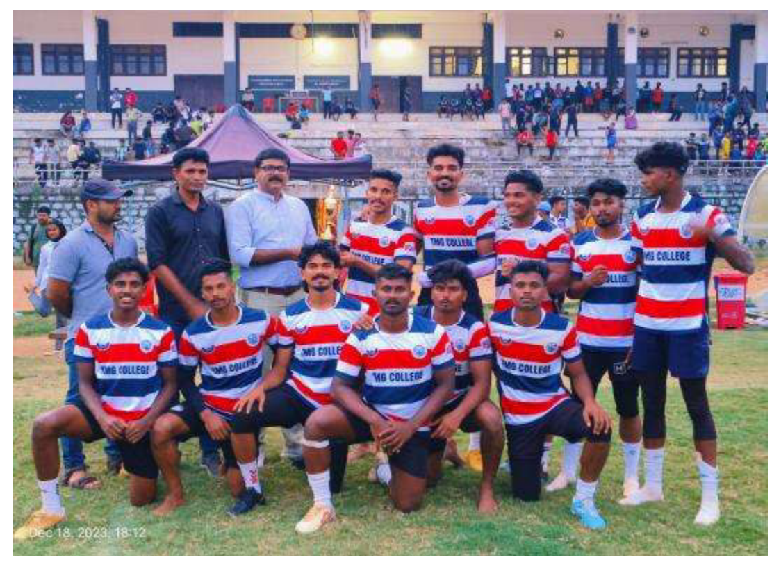
TEAM TMG @ AIU RUGBY VENUE

CALICUT UNIVERSITY MEN RUGBY RUNNER-UP 2023-24