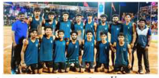
Senior State Runner-Up