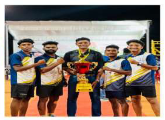
TMG COLLEGE KHO-KHO PLAYERS WITH ALL INDIA INTERUNIVERSITY KHO-KHO CHAMPIONSHIP TROPHY