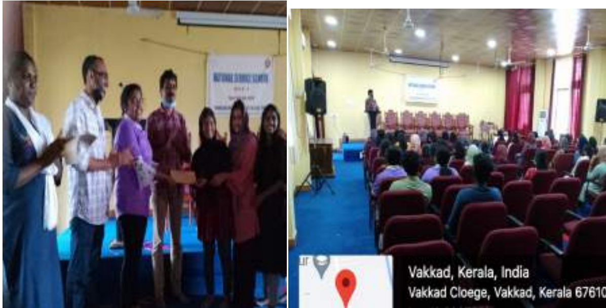
22-08-2022 Nattarivu programme